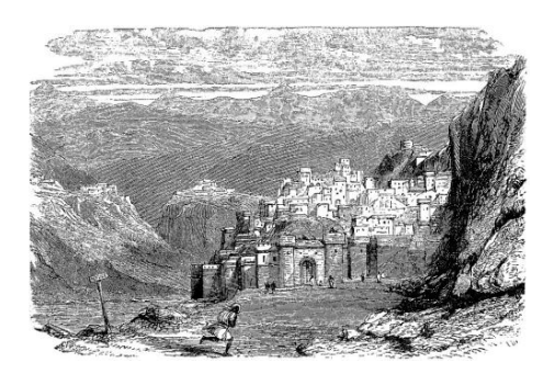
Numbers 35:9-34 discusses the Cities of Refuge.

According to Torah, Yahweh had commanded that the Levites would not receive any land in Eretz Yisrael but they would receive cities and they would also dwell in the cities of the rest of the Israelites.